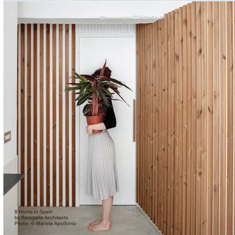
B Home in Spain by Baragaño Architects