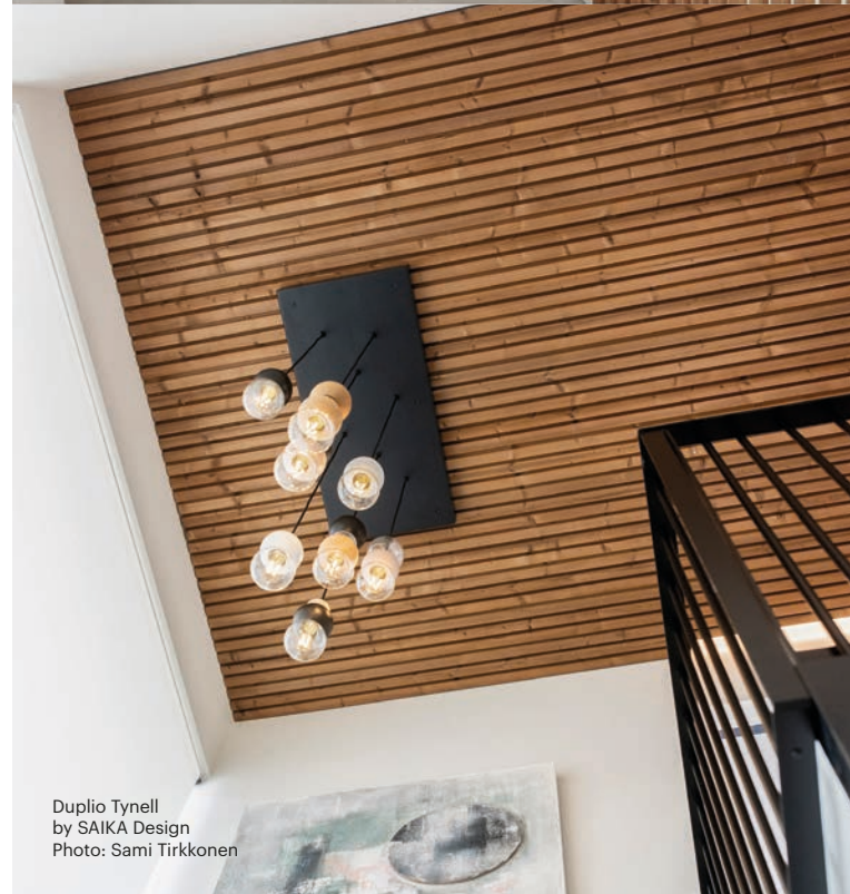
Duplio Tynell by SAIKA Design