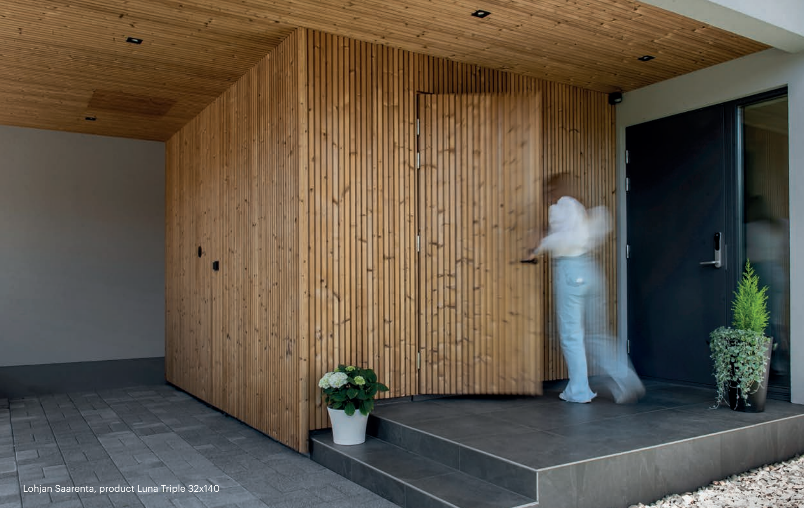
Lohjan Saarenta, product Luna Triple 32x140