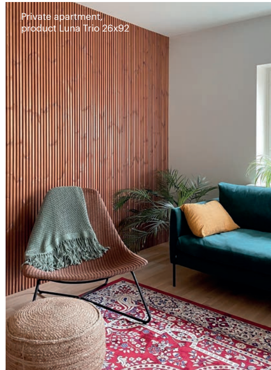
Private apartment, product Luna Trio 26x92