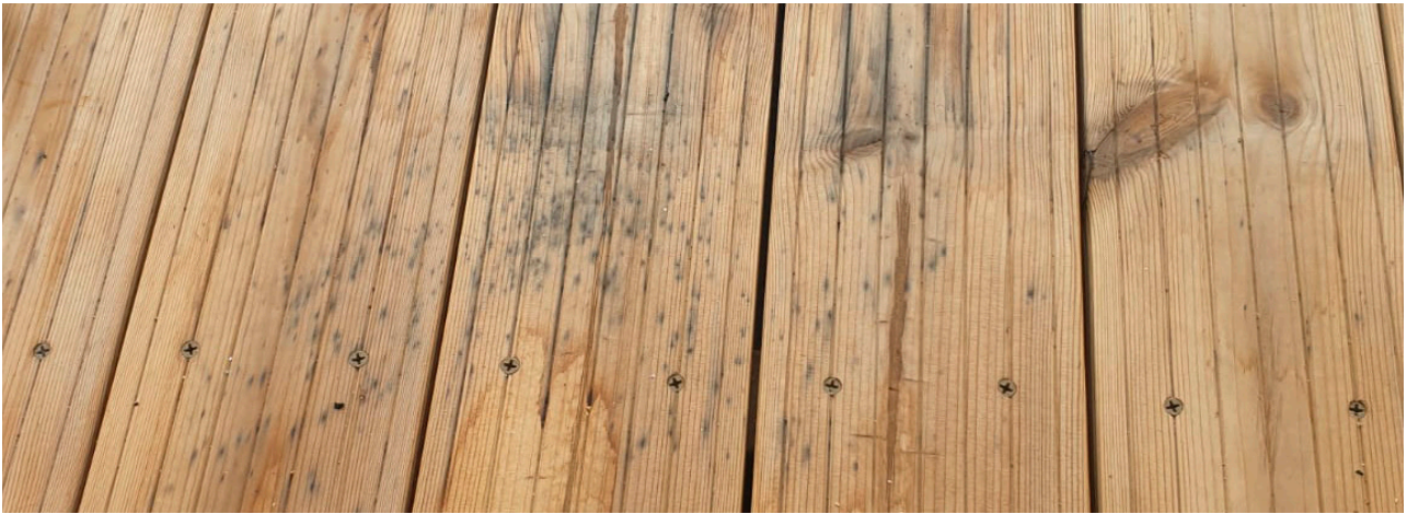
Impurities can cause small black spots on the surface of the decking.