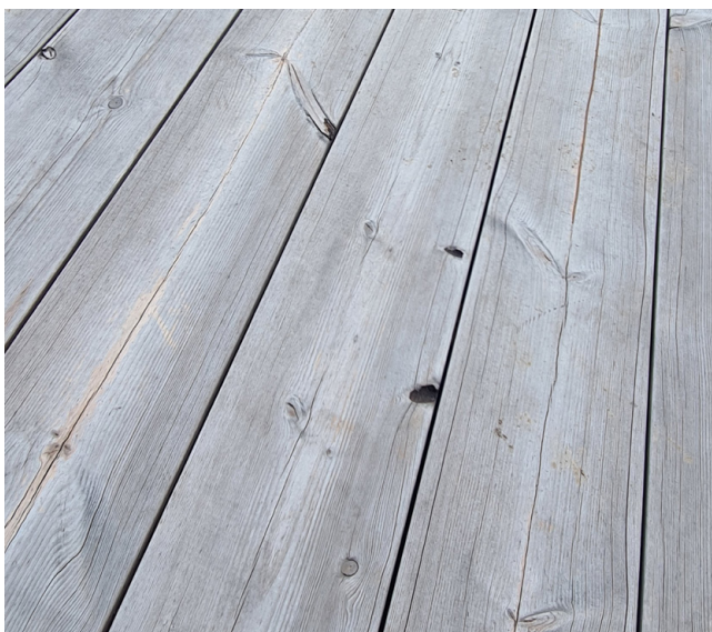
Untreated Lunawood decking (Thermo-pine) 2 years after installation. Small hairline cracks can be seen on the surface.

If your decking has already turned grey and you want to restore its original colour, you can use a strong washing liquid and/or sanding. After that, the surface can be treated normally, for instance with brown-pigmented oil that helps to maintain the colour. See the instructions under "Maintenance With Oil".