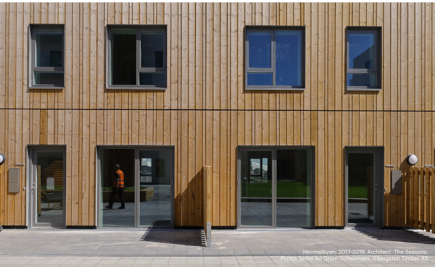
Himmelbyen, 2017-2019. Architect: The Seasons.