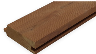
Luna Panel System 26x92