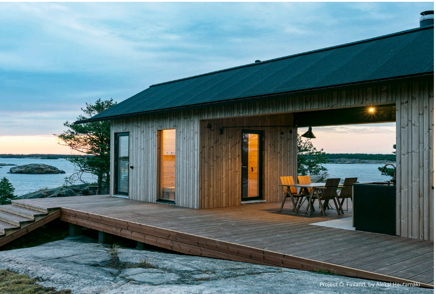
Project Ö, Finland, by Aleksi Hautamäki