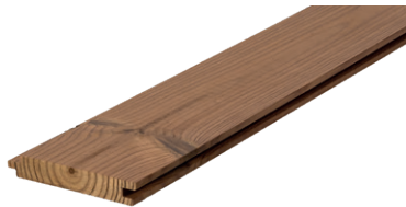
Luna Panel System 19x117