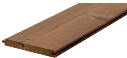
Luna Panel System 19x165