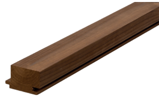
Luna Panel System 42x68*