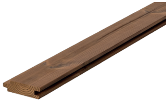
Luna Panel System 19x68