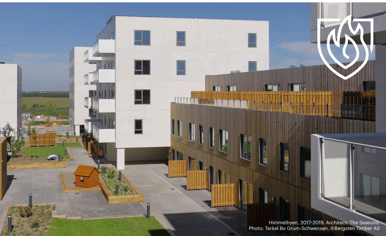
Himmelbyen, 2017-2019. Architect: The Seasons.