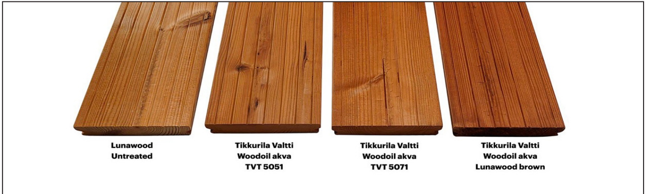
Comparison of Tikkurila oils applied to Lunawood Thermowood

Apply 1–2 layers of pigmented terrace oil, such as Tikkurila Valtti Plus -wood oil tinted with Lunawood Brown, TVT 5051 or TVT 5071.