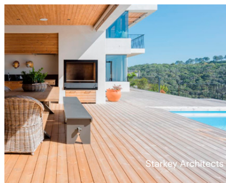
Terrace of a private home in South Africa. The decking in the sunny area has turned gray faster compared to the shaded area.